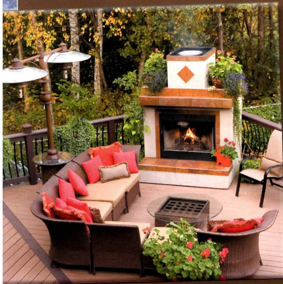
DECK DESIGNED AND BUILT BY TREELINE CONSTRUCTION

Here are some fiery ideas to help warm up and enhance the ambiance of your outdoor space.