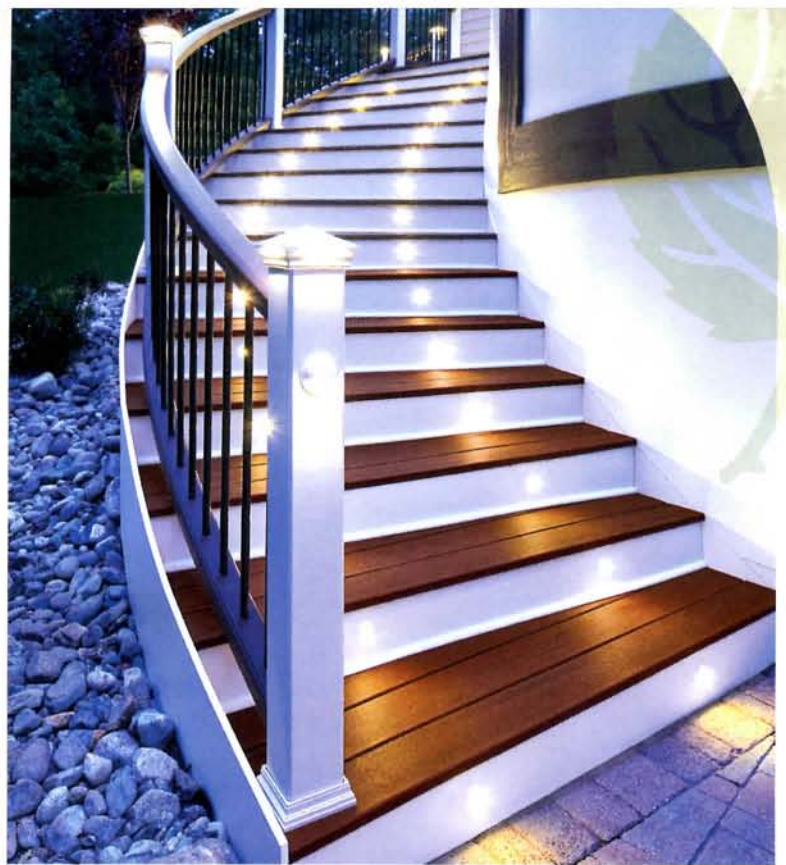
DESIGNED FOR USE ON POSTS, FLOORS AND STEPS, THE NEW TREX DECKLIGHTING CREATES A DIMMABLE GLOW THAT SETS THE MOOD AND KEEPS YOUR DECK ILLUMINATED. THE LIGHTS OPERATE FOR UP TO 40,000 HOURS AND USE 75 PERCENT LESS ENERGY THAN TRADITIONAL INCANDESCENT LIGHTING.

With all the new materials and design trends in decking, be sure to consult with an experienced deck builder before you build your deck. You will enjoy your deck for many years to come if it is built properly and designed to fit your lifestyle.